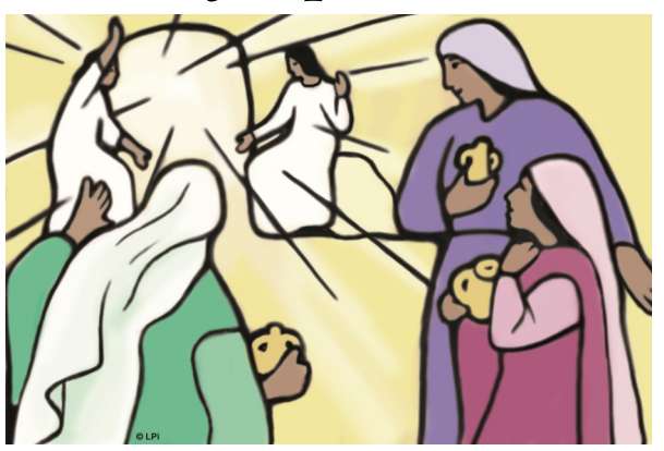
The women who had come from Galilee with Jesus took the spices they had prepared and went to the tomb. They found the stone rolled away from the tomb; but when they entered, they did not find the body of the Lord Jesus. - Lk 24:1b-3