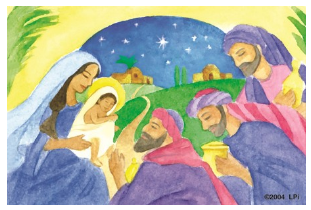
"And you, Bethlehem, land of Judah, are by no means least among the rulers of Judah; since from you shall come a ruler, who is to shepherd my people Israel." - Mt 2:6