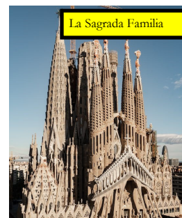
La Sagrada Familia

The last stop was Naples , but we didn't go out that day as it was raining. On the last day we reached our destination, Civitavecchia, and we took the transfer to the Rome airport. This is a big airport that is very modern with lots to see and so many people in there!!