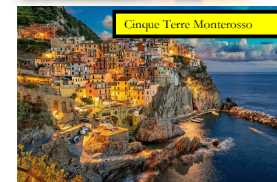
Cinque Terre Monterosso