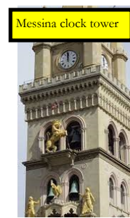
Messina clock tower