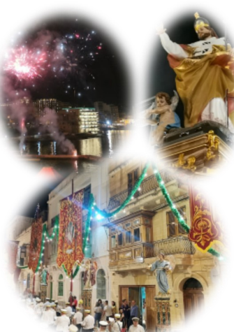
Festivities of St. Gregory the great