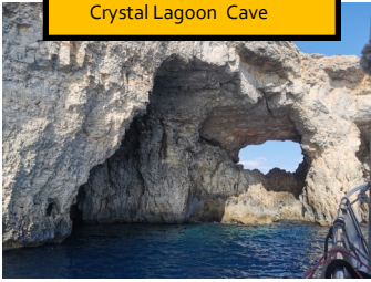
Crystal Lagoon Cave